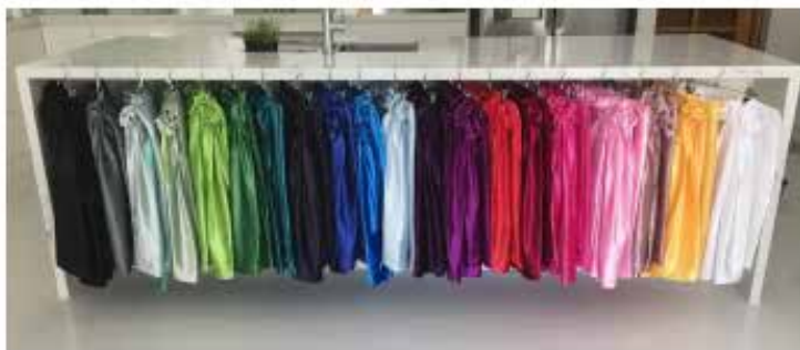
Curtain Sets in 24" and 30"