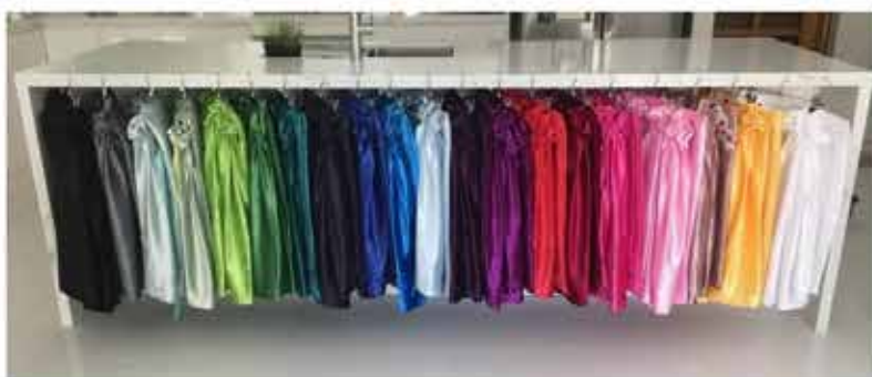
Curtain Sets in 24" and 30"